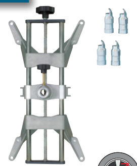
STD433EU 10"-24" Pair of self-centering 4 point clamps, with removable claws. (Optional 3point fast clamps)